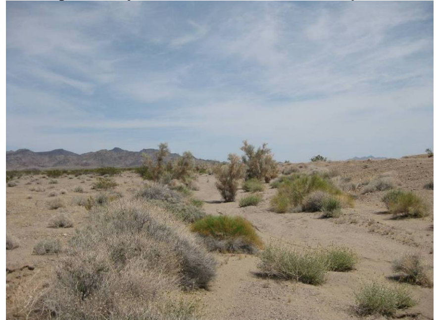
Figure 6: Mojave Wash Scrub with additional species