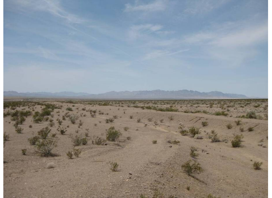
Figure 4: Disturbed Mojave Creosote Bush Scrub

Example of disturbed Mojave creosote bush scrub located at the southern end of the survey site adjacent to the Colorado River Aqueduct. This area consists of spaced shrubs and sparse herbaceous layer.