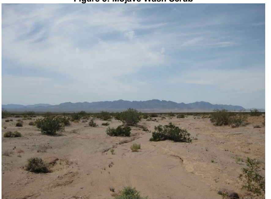
Figure 5: Mojave Wash Scrub