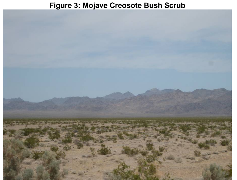
A relatively average and undisturbed portion of Mojave creosote bush scrub.