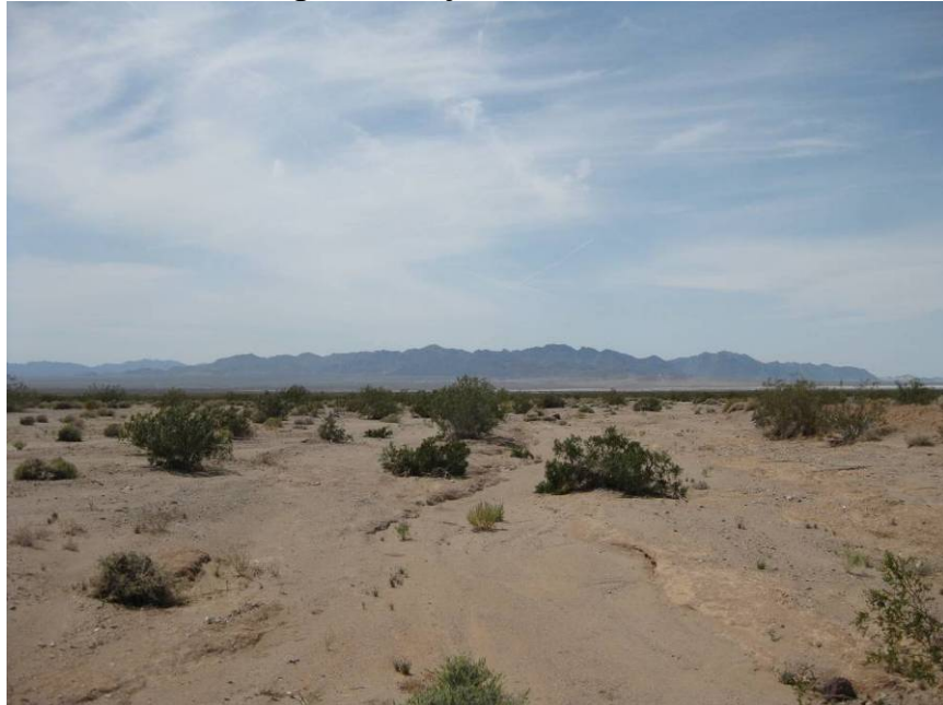
An example of a Mojave wash scrub dominated with creosote bush scrub species..